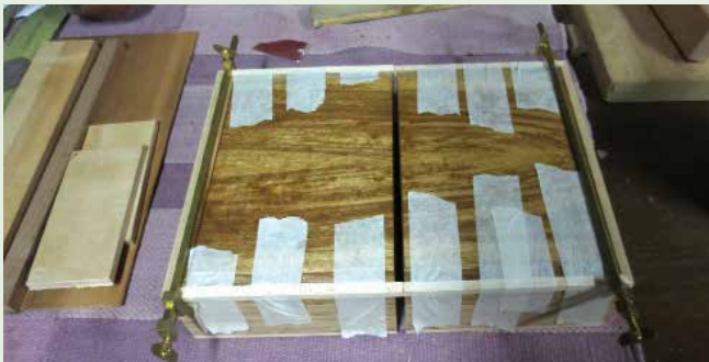
Gluing the strips of maple in place

In order to add interest to the piece, I added quartersawn maple edge inlays to all the box edges (top and bottom). I made all the strips with two sides exactly at 90° to be able to glue them to the sides. Once they are glued in to the box I hand planed them to get a nice smooth surface, being careful not to touch the lid which was already finished with shellac. These pieces also allow me to hide the brass pins that will act as the lid pivot hinges.