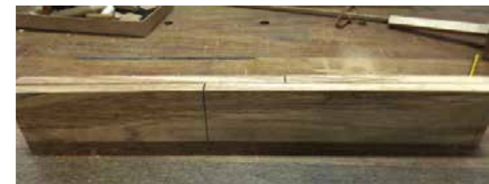
Bookmatching the piece

Getting continuous grain boards Start with the wood selection and prepare the boards to get four continuous grain pieces. There is a simple way to get a nice, continuous grain pattern, as shown here: divide the board in two by sawing it in half, then cut the two boards in two parts again.