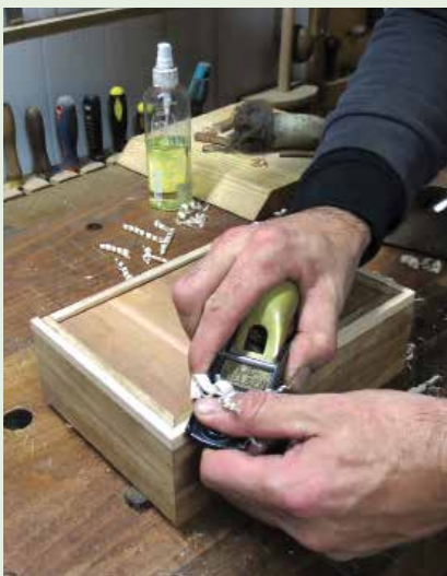
Levelling off the maple strips