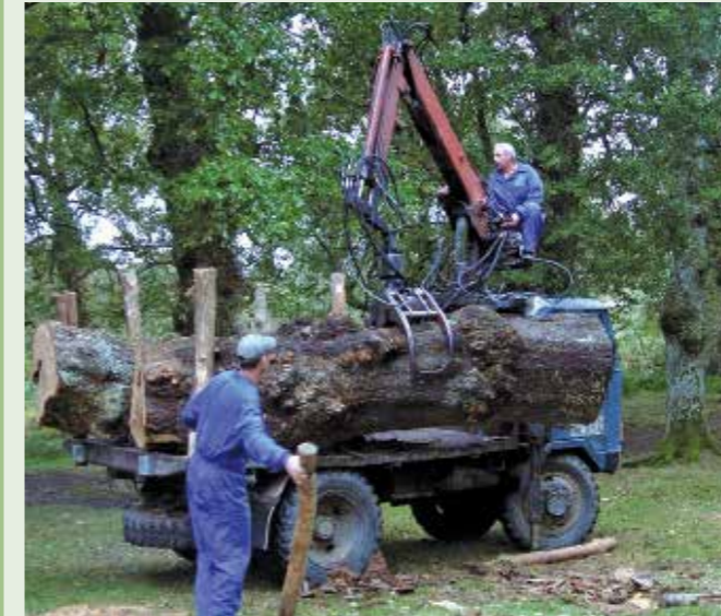
Ready for the saw mill

For this box I used timber from an old dead oak that was cut down about four or five years ago. I took it to the saw mill and got 4cm-thick boards and after four years of air drying I started working them. The first time I hand planed them I noticed that it was much easier than other oaks I've used. I'm not aware of any studies comparing air-dried wood vs kiln-dried wood, but after years of testing both, I find air-dried wood to be more hand tool friendly than kiln-dried wood.