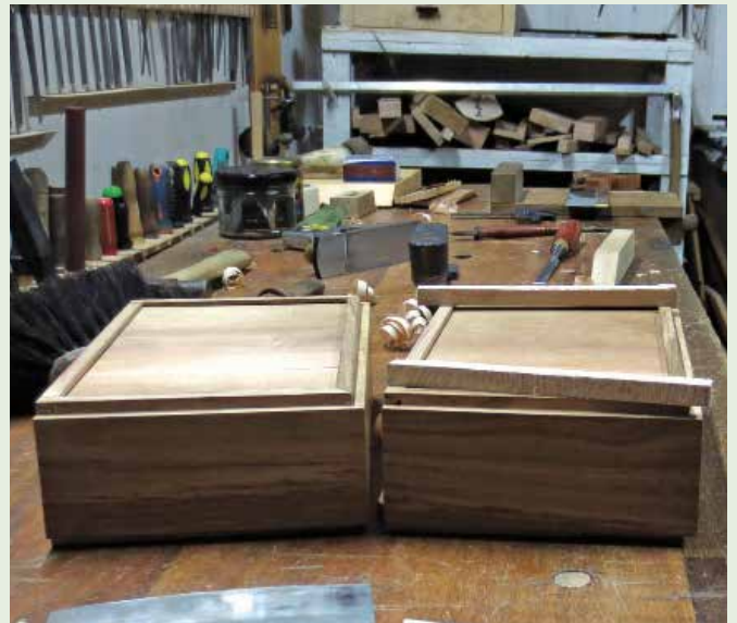
The maple strips are left proud and mitred at the corners