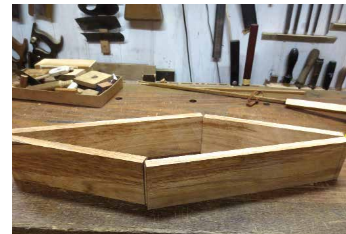
Cross cutting the two pieces in four