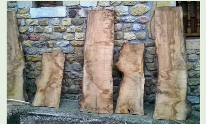
Some of the boards after air drying