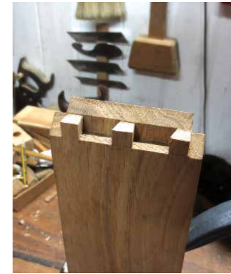
Pins and mitres are ready

When I cut dovetails my preferred method is to start by cutting the tails and then use them to mark out for the pins. This process is reversed when it comes to secret mitred dovetails. After these are completed, I start forming the mitres with my No. 62 plane, stopping just short of the knife line. Then carefully from one side and then the other, I chisel to the line. It is important to check the mitres as you are working on them as it is almost impossible to close even the slightest gap through clamping. When the mitres are done you can turn your attention to producing rebates for the maple detail line and grooves on the inside faces for the tray runners and the bottom of the boxes. The bottom is made from quartersawn red cedar, which is difficult to leave a mirror finish on given its soft grain and the silica in its cells.