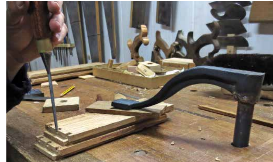
Chopping the tails