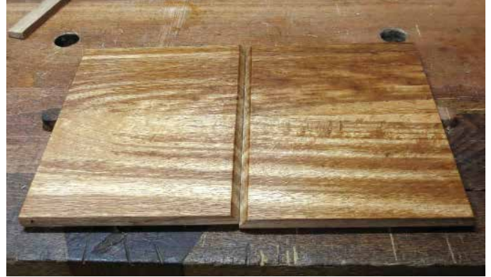
The lids are pre finished before assembly

Cutting the lid in two parts with a continuous grain pattern was done in exactly the same way as dividing the sides in two. The box is made so that it has to be separated in order to open it. Chamfers are cut along the bottom edge of the lids to make them easier to open when the boxes are apart. The lids were given a coat of shellac before fixing to the box as access to all areas afterwards would not be possible.