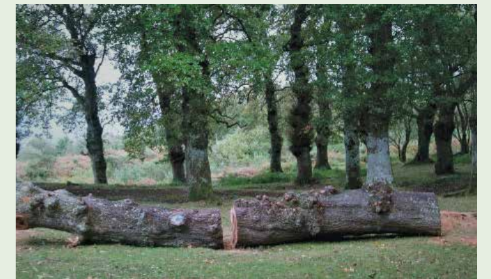
The oak tree that supplied the timber