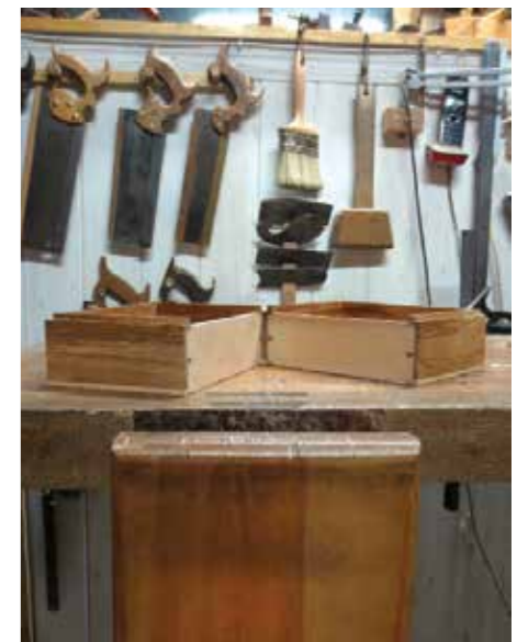
Both boxes glued up with magnets in place