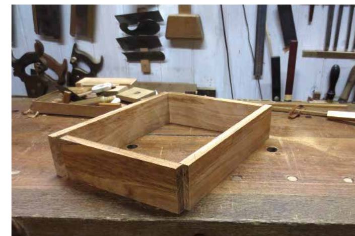
The result: continuous grain pattern