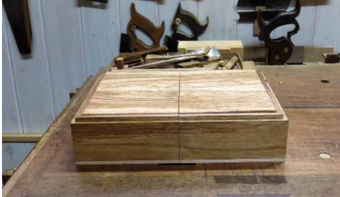
Checking the lids for alignment

The pivot hinges for the two lids are hidden. As you can see, the grain of the lid flows with the grain of the sides. This means that, with the wood movements, the lid could be stacked in the box. For this reason you have to know how your wood will behave when the box is finished, in this case given that the moisture in my shop is very high, I made them very tight, so they will shrink a little bit in their new home and therefore leave a small gap between the sides and the lid.