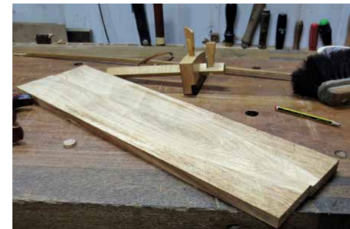
A single board split down the middle

Getting continuous grain boards Start with the wood selection and prepare the boards to get four continuous grain pieces. There is a simple way to get a nice, continuous grain pattern, as shown here: divide the board in two by sawing it in half, then cut the two boards in two parts again.