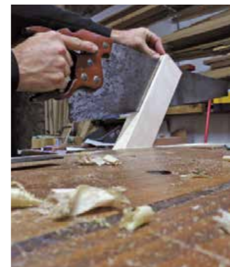
Ripping maple by hand to get the inner sides of the boxes from the same board (inside the box)

Given that I wanted to make something different, I decided to cut the box in two equal parts so I could have two boxes that look like one box when they are together. I used half-blind dovetails on the mating sides of the boxes and added four rare earth magnets behind the tailpieces in order to hold them together. This part has to be done carefully so that the grain continues the same; you don't want to remove a lot of wood as that will affect the flow.