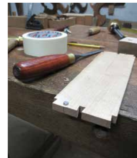
Rare earth magnets are buried into the tails of the sides before gluing the box together